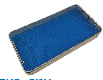
T1AT + T1SM TORS Instrument Tray