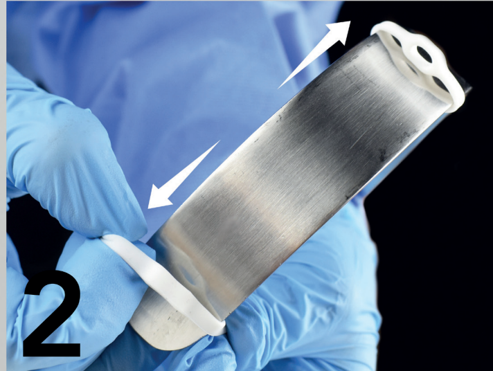
2. Adjust both retractor loops to allow sufficient space in-between them.