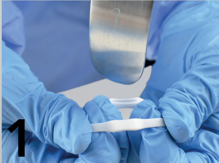
1. Secure the retractor loop around the retractor by stretching the central loop. Repeat with second retractor loop.