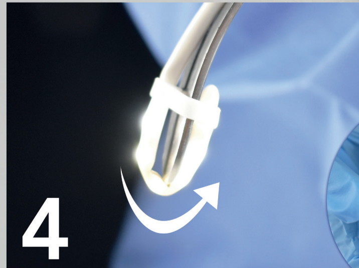
4. Bend the KLARO™ light strip around the tip of the retractor.